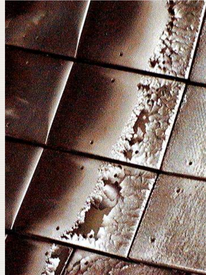
Flaking of co-deposited layer on lower part of limiter, TFTR, Nov 1998

Planning a real dust database! Effort centred at IPP Garching; based on analysis of 10s of thousands of individual dust images